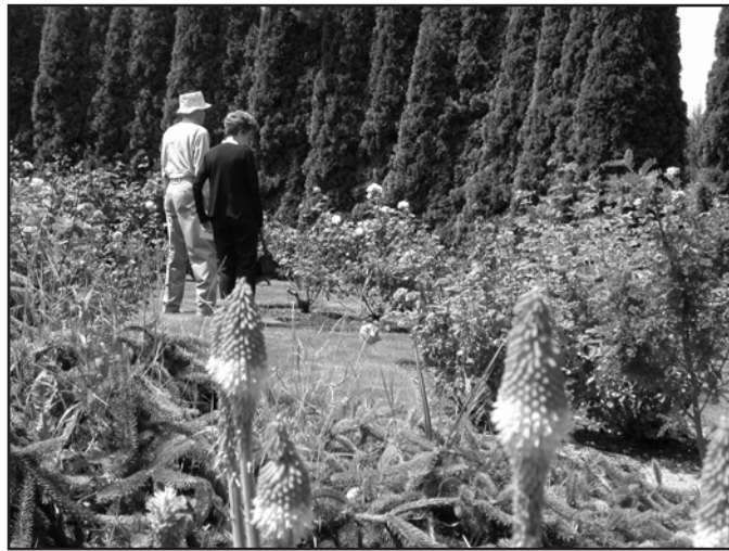
Members of the public stroll through the Arboretum during the Development Office's 19 th Annual Tour & Tea.