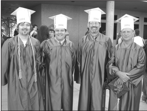
Culinary students don custom mortarboards before the 34 th Annual Commencement on June 17.