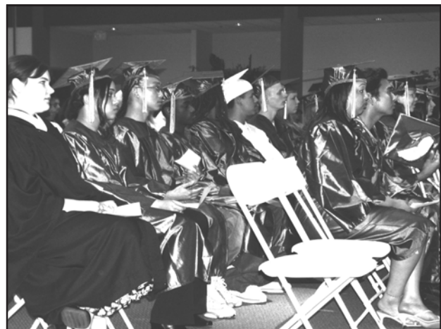
Career Link Academy students graduate on June 16.