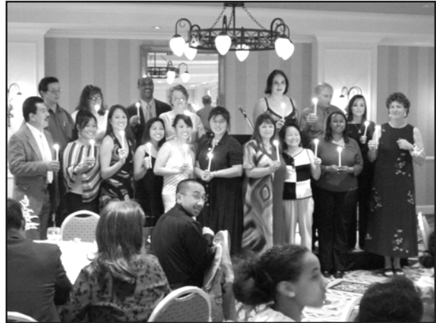
LPN program graduates take the "Florence Nightingale Pledge," which is similar to the Hippocratic Oath taken by physicians, and promise to do their utmost for the care of their patients. The pledge was part of the program's pinning ceremony on June 16 at the Hotel Monaco in downtown Seattle. The pinning ceremony is a nursing tradition dating back before the turn of the twentieth century. Traditionally, nursing students have conducted the ceremony to mark their passage from the role of student nurse to practicing nurse. It also signifies that necessary program requirements have been completed.