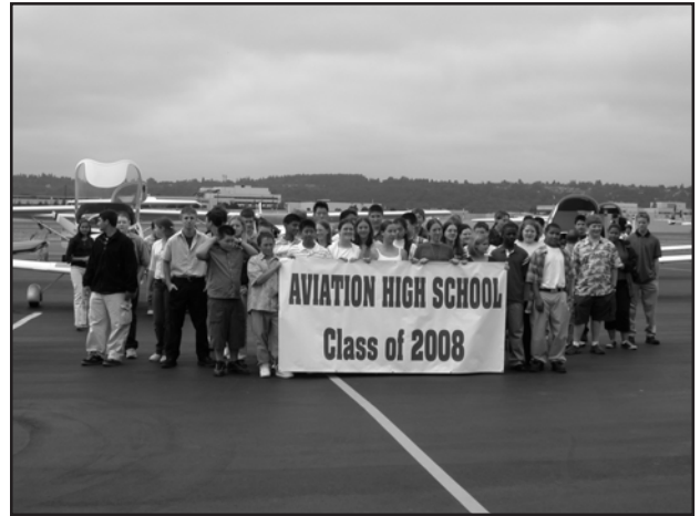
Aviation High School's first freshman class celebrates the opening of the school at Boeing Field on July 1.

The school is already generating publicity with an article in the June 7 edition of the King County Journal. Go to http://www.kingcountyjournal.com/sited/story/html/165679 to read the entire article.