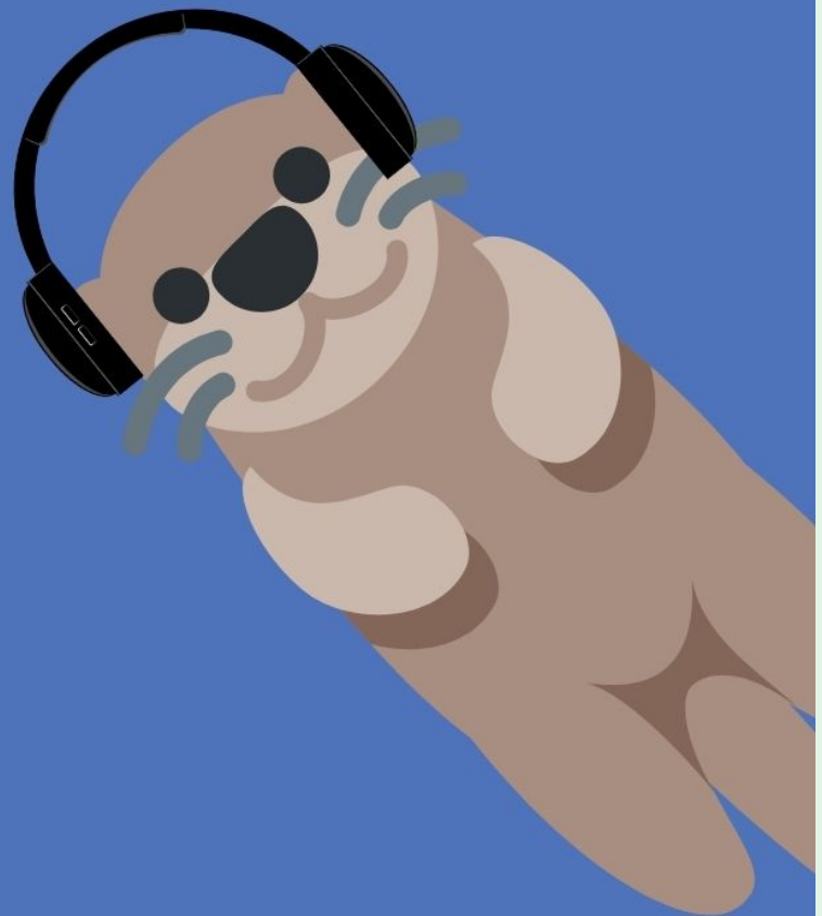
Image Description: Like an album cover, a very round and cute otter is laying down with earphones on. A small message beside it for all the listeners: "you're otter this world" with a big red heart.