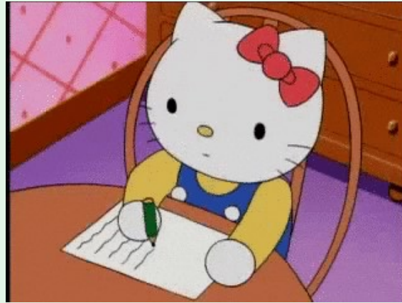
Image Description: Hello Kitty doing her best to write on a paper with a determined look on her face.